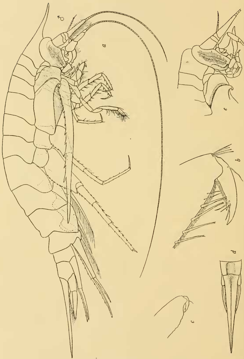
FIG. 1.— Cyphocarid johnsoni , new species. a , entire animal ♂; b , gnathopod 1♂ greatly enlarged; c , gnathopod 2♂ greatly enlarged; d , telson ♂; e , head of female.